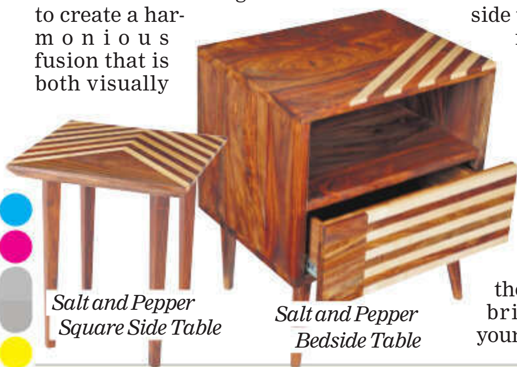
Salt and Pepper Square Side Table