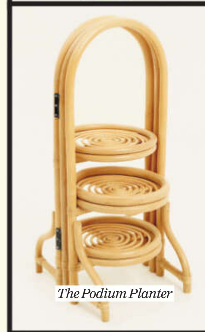
The Podium Planter